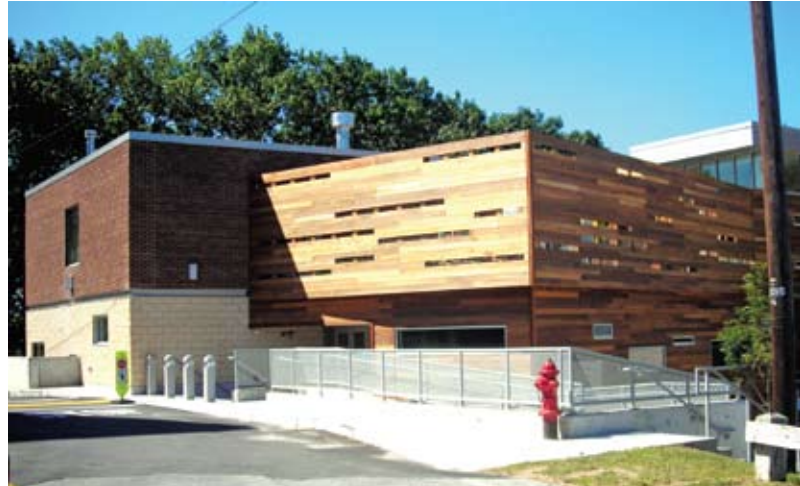
The new Adolescent Center, located adjacent to St. Ann's existing buildings, opened April 30, 2008.

With the new Adolescent Center coming on line