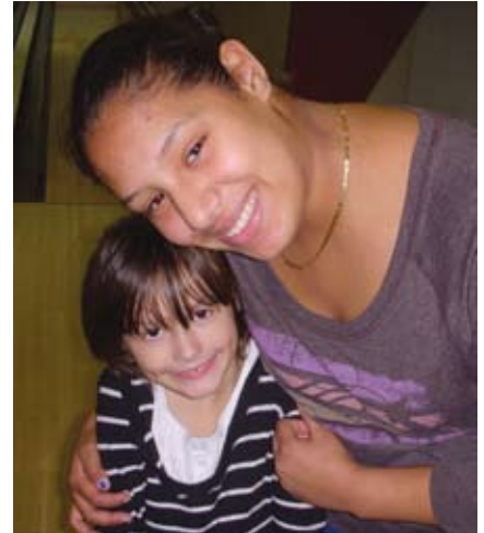
Learning from each other can make you smile.

After each get-together or outing, the Peer Leaders come together, maybe over pizza, and talk about their experiences and time with their Little Buddies. Staff help guide and facilitate the discussion, but it is really the insights, ideas, problem-solving and thinking skills of the Peer Leaders that shine through at such meetings. Sometimes a child will have a problem or an issue to bring up; often, however, they